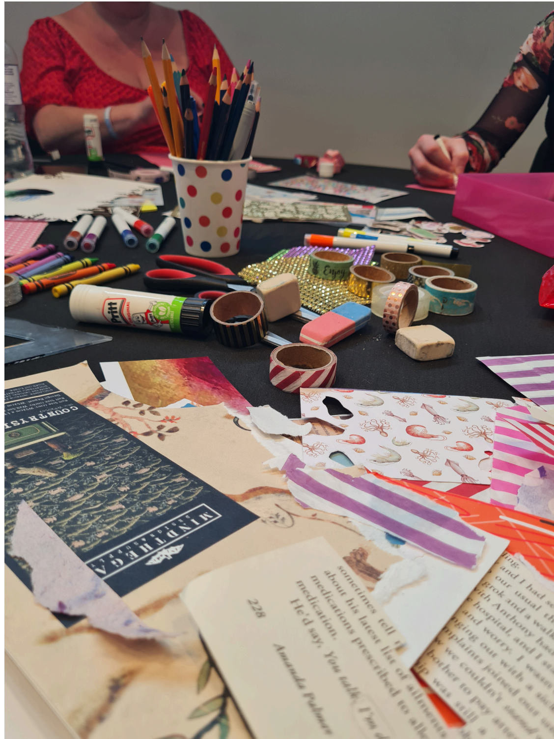
[Image Description: A close up picture of the different crafting materials on the table. There is decorative paper, tape, pens, glue, stickers and rhinestones.]