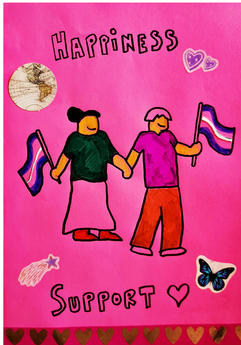
Artwork by Jamei-Jade

[Image Description: A collage on pink paper. In the middle of the page is a drawing of two people holding hands. In their other hands they are holding trans flags. Above the drawing is the word 'happiness' and stickers of a map and some hearts. Below the drawing is the word 'support' and stickers of a shooting star and a butterfly.]