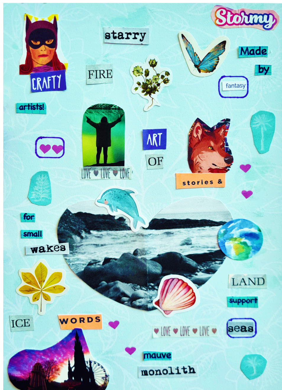
Artwork by Linda

[Image Description: A collage on pale blue paper. In the middle of the page is a heart cut out of a picture of the sea. Across the page are various stickers and pictures including small pink hearts, sea creatures, butterflies and leaves. There are multiple cut out words across the page, from the top it reads: 'Stormy', 'starry', 'crafty fire artists!', 'made by fantasy', 'art of stories &', 'for small wakes', 'land support seas', 'ice words', 'mauve monolith'.]